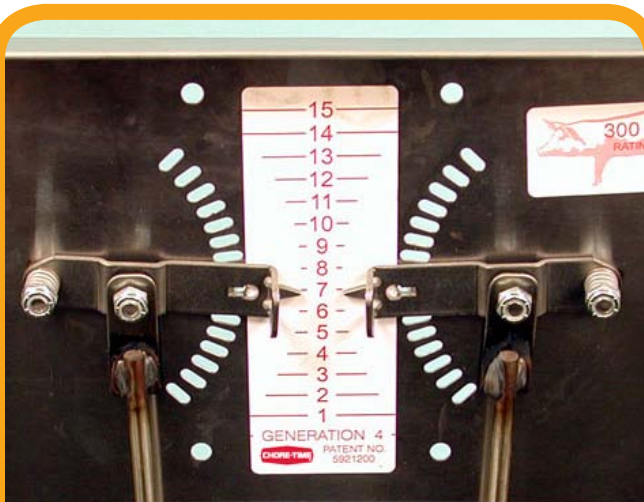
Patented Feeder Adjustment